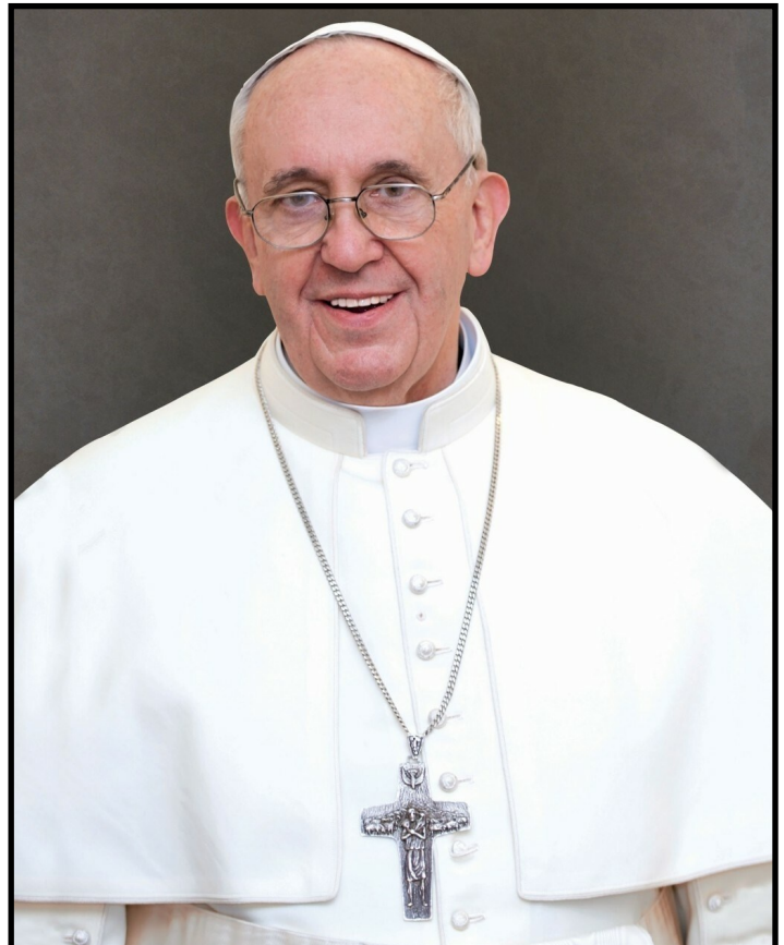
Happy 84th Birthday Pope Francis!