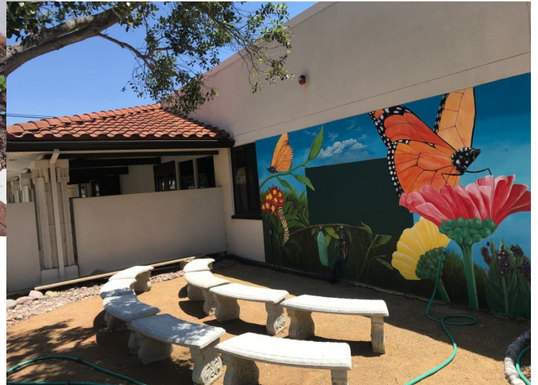
St. James' outdoor classroom.