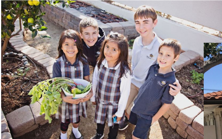
St. James students enjoy the garden bounty at their Green Ribbon School.