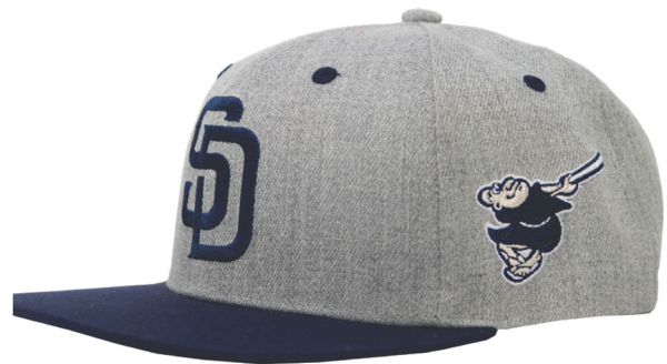
CATHOLIC NIGHT HAT

Come together with the San Diego Catholic community and the Padres for Catholic Night at Petco Park. Your Catholic Night Theme Game Package includes a limited-edition Catholic-themed Padres hat and a ticket to the Giants vs. Padres game. We will be purchasing a block of tickets for the game. Check back next weekend for more information and don't forget to check the website for updates.